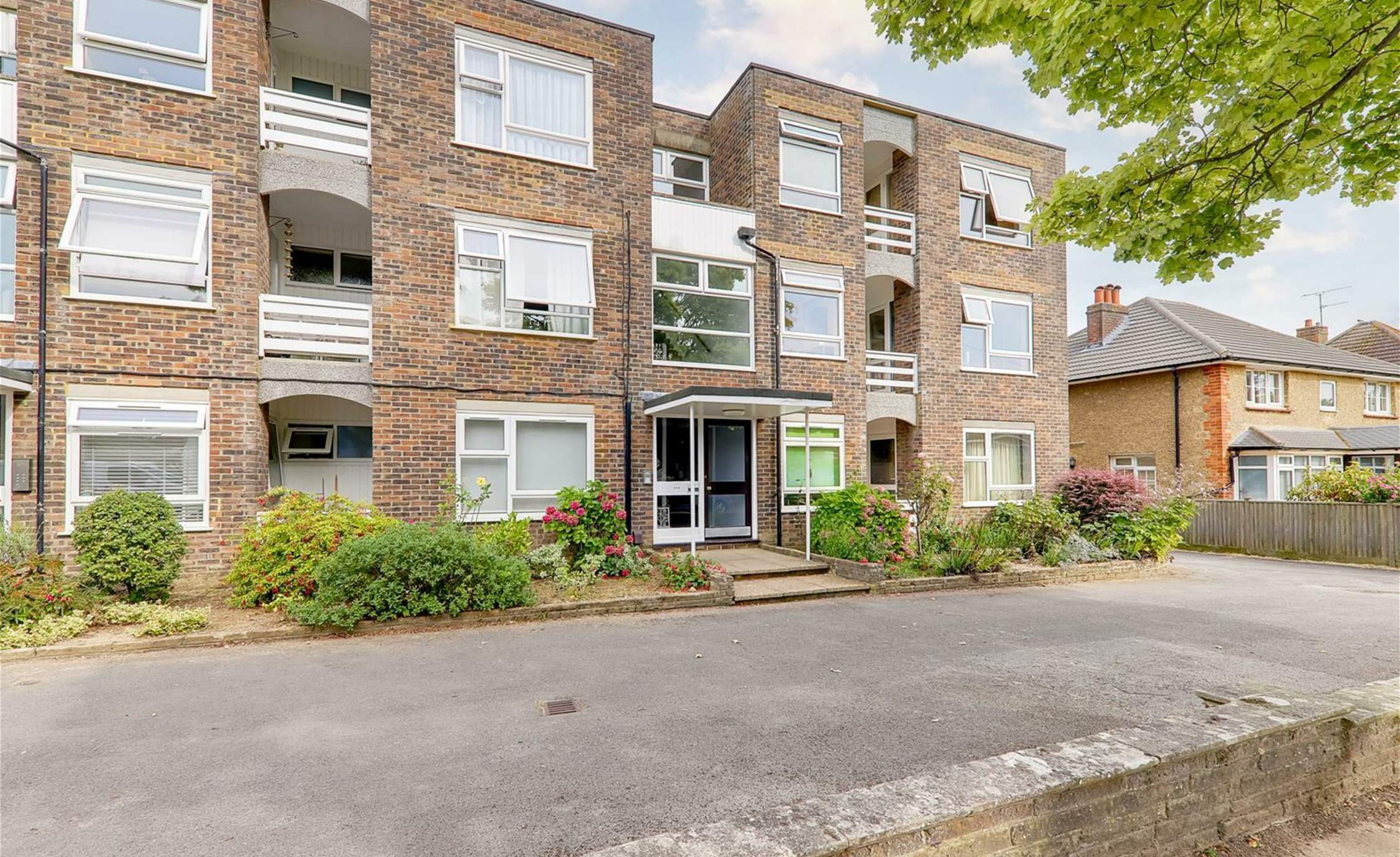
1 Wimborne Court, Brooklyn Avenue, Worthing, BN11 5QW Asking Price £240,000